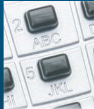
Large Punch Buttons