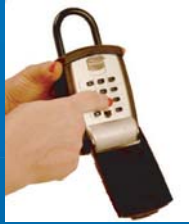
Familiar Phone Keypad Entry

Flexibility of text and/or numbered punch buttons like a phone keypad!