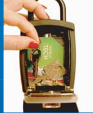
Large Storage Area