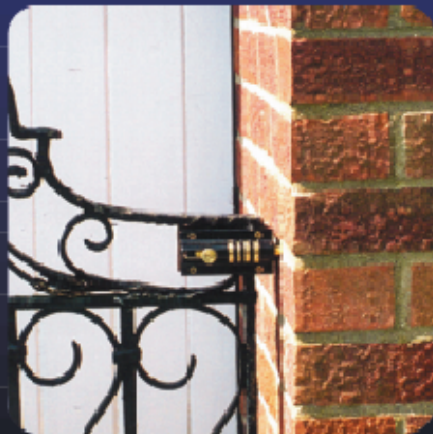
No need to keep track of keys!

The Combi-Bolt offers an innovative keyless security solution without the need to hassle with or losing keys. Great for sharing access with others and the combination can be easily reset at any time. The Combi-Bolt offers versatile, easy-to-install keyless security for a wide variety of applications.