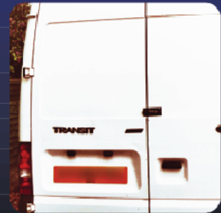
Trailers, RV's and Vans

The Combi-Bolt offers an innovative keyless security solution without the need to hassle with or losing keys. Great for sharing access with others and the combination can be easily reset at any time. The Combi-Bolt offers versatile, easy-to-install keyless security for a wide variety of applications.